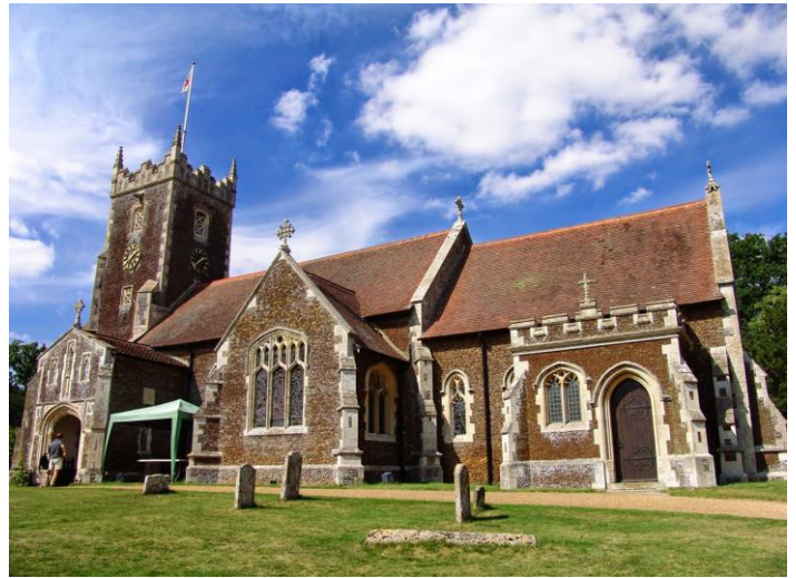
St. Mary Magdalene Church, Sandringham, England